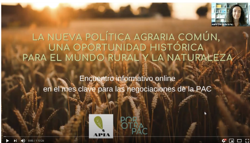
La nueva PAC, una oportunidad histórica para el mundo rural y la naturaleza (Por Otra PAC - APIA) 121 Aufrufe • Premiere am 26.10.2020

2. Engage with them adapting your story to their interests and needs and pitching it to them.