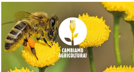
NEWSLETTER N. 2 - Luglio 2020

Civil society coalitions assemble a diversity of organisations willing to work together and form a strong, joint voice. To keep them dedicated, it is important to have regular and clear internal communication.